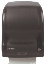
Reliable Brand® Touch Free Mechanical Roll Towel Dispenser