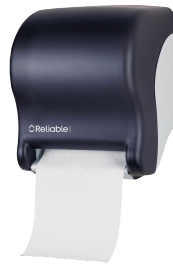
Reliable Brand® Touch Free Electronic Roll Towel Dispenser