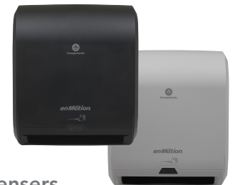
enMotion® Automated Touchless Paper Towel Dispensers