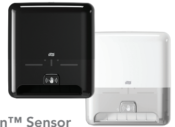
Tork Matic® Hand Towel Roll Dispensers w/Intuition™ Sensor