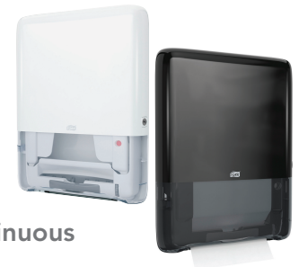
Tork PeakServe® Mini Continuous Hand Towel Dispensers