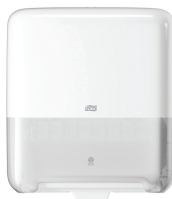
Tork Elevation Matic® Hand Towel Roll Dispensers