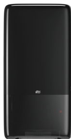
Tork Elevation® PeakServe™ Hand Towel Dispensers